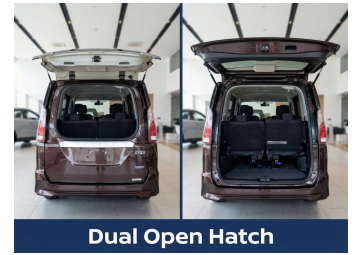
Dual Open Hatch